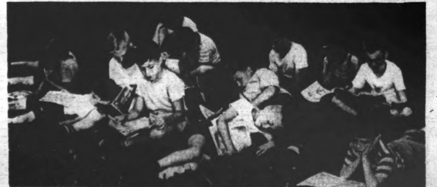
THE WEARY REST —Some "campers" at the Ridgefield YMCA Day Camp catch up on sleep when rest period rolls around while the more rugged reach for their comic books. The camp is open for a six-week period ending Aug. 22. These boys have been spending their time swimming, playing games and learning handicrafts.