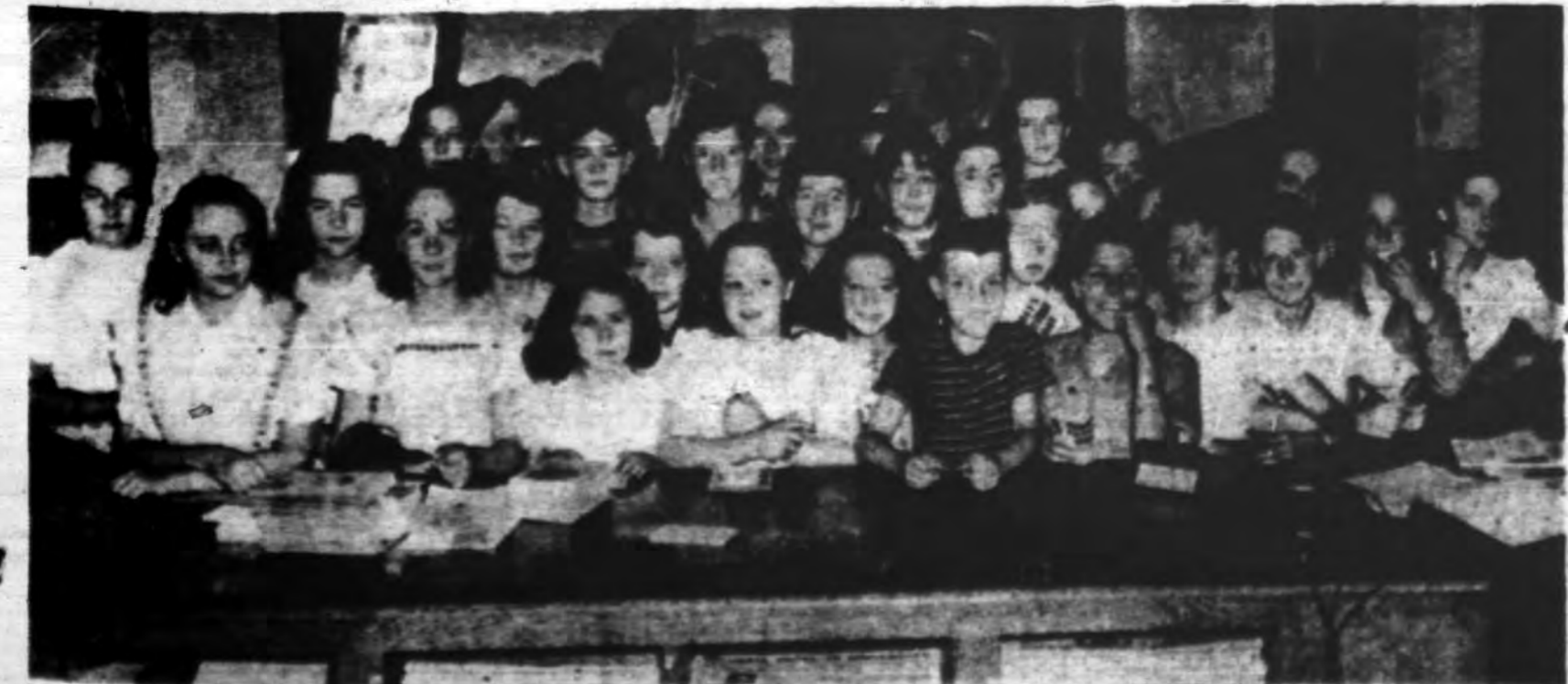
K-N GUESTS —The latest school group to inspect The Knickerbocker News plant was this party from the sixth grade at Elmers Grade School. Here they smile for the photographer after seeing how a newspaper is produced each day.