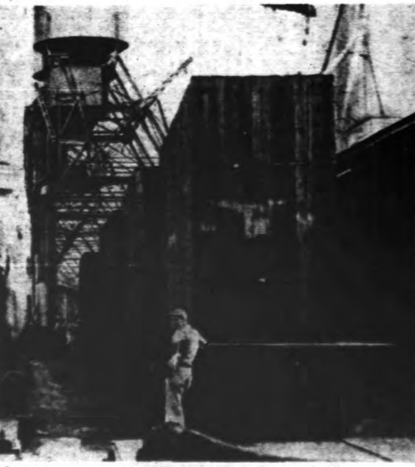
MAKING SHIP FAST —Dock workers complete last minute adjustments as the Holland America liner Westerdam was made fast to the dock at the Port of Albany yesterday near this pile of relief cargo. The ship sailed up the Hudson with an expert pilot on the bridge.