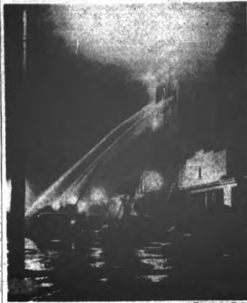
Fire of undetermined origin early today swept Germania Hall, 134 River St., Troy. More than half of Troy's fire fighting equipment answered the alarms. Shown here are firemen battling the fire at the height of the blaze.